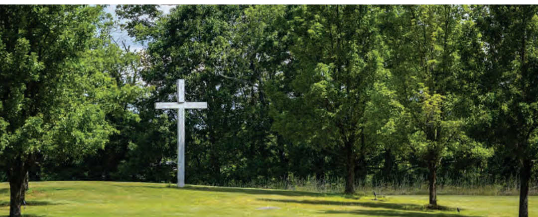
The six trees at Anna Maria College are a memorial for the six firefighters lost in the Worcester Cold Storage Fire.

The 25th Anniversary of the Worcester Cold Storage Fire