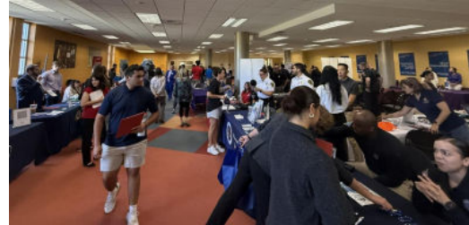
Photo left: Mac the Amcat, dressed to impress, took advantage of networking opportunities with employers like the WooSox!

Photo above: The Information Commons was buzzing with Anna Maria students and employers throughout the day!